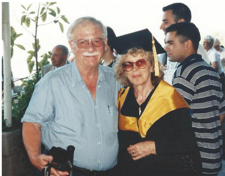
Getting an MA in Philosophy from Haifa University, 1994