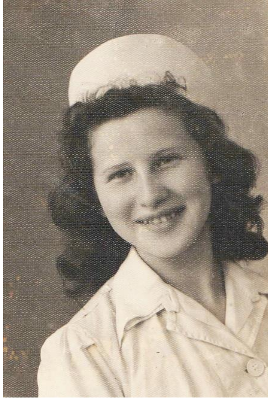
Aged 15, working as secretary in the Israel's Health organization, 1949