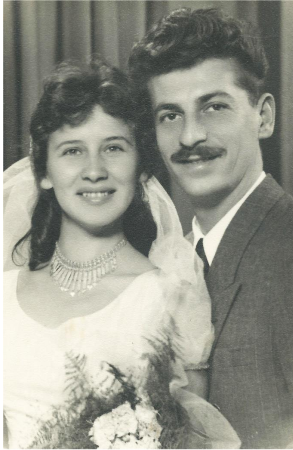
Getting married, Haifa 1953